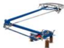
Lokomotivy a elektrické jednotky